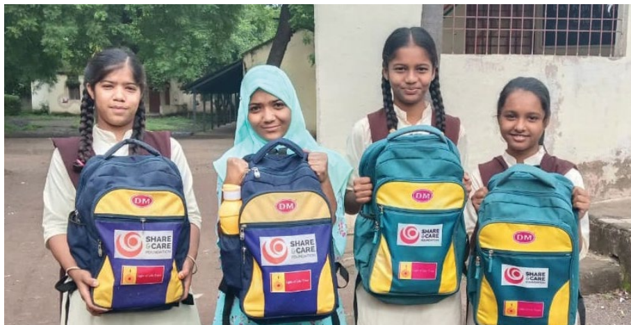
In addition to one-on-one support, E2S students are equipped with the supplies they need to succeed, such as these colorful backpacks.

Fact: 91% of the parents of Anando beneficiaries earn less than Rs 5,500 monthly. Today, 76% of employed E2S beneficiaries earn between Rs 5,500 and Rs 80,000 monthly. Higher wages can have a major, positive impact on families and their communities for generations to come.