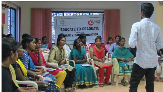
Our Educate 2 Graduate program supports brilliant, but economically challenged students as they pursue higher education.