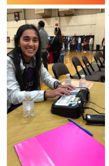
K4K members generously donated their time during a volleyball tournament to keep score and sell Share & Care merchandise, with all proceeds going to the E2S program.

Share & Care's Kids4Kids (K4K) program is a group of more than 65 hard-working students between the ages of 12 and 18 in the New York and New Jersey areas. K4K members are passionate about making a difference by supporting other children in the pursuit of education. Their work funds our Educate 2 Success (E2S) Signature Program, which provides resources to students in rural India who are most at risk of dropping out and not finishing their schooling.