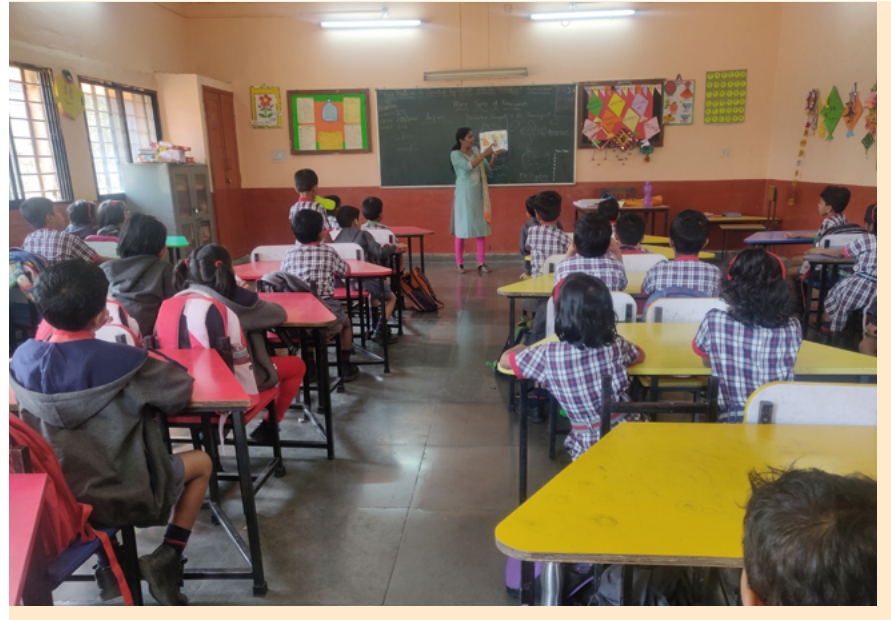
With the support of Share & Care, Arpan's Personal Safety Education program offers age-appropriate, classroom-based trainings to students to help them identify and prevent child sexual abuse.

Since its inception, the project has provided training to more than 240,000 children and adults through the Personal Safety Education program across 3 districts in Maharashtra. In the 7 years that Share & Care has supported the program, more than 7,900 children and 2,800 adult have benefited from the Personal Safety Education program. Together we are working to create a world free from child sexual abuse.