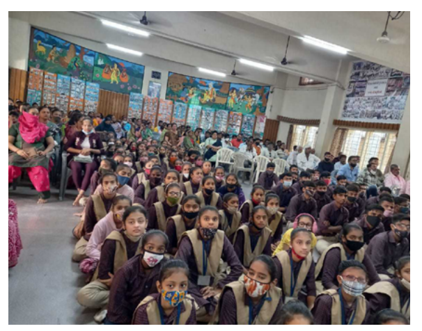
In the first half of 2022 alone, RCS has provided 239 cancer awareness sessions educating more than 73,000 people about cancer, detection and prevention, and treatment options.