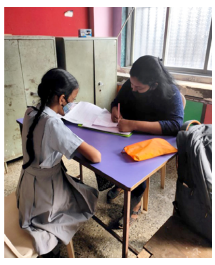
Arpan provides individual counseling services to offer students a safe place to disclose situations in which they were unsafe and seek support.

To combat the alarming prevalence of abuse, the Personal Safety Education program takes an innovative approach to address child sexual abuse through a prevention and intervention lens. The program trains adult caregivers on how to keep children safe while training children to protect themselves from abuse and seek support if an incident occurs. Along with age-appropriate, classroom-based group training sessions, counselors work with each child individually to provide a safe place for disclosure