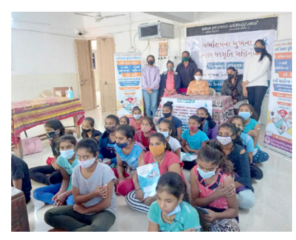
With the support of Share & Care, RCS was able to provide HPV vaccinations for an additional 678 girls.

The program empowers patients to achieve their best possible quality of life regardless of income and believes that no patient should be turned away for lack of money.