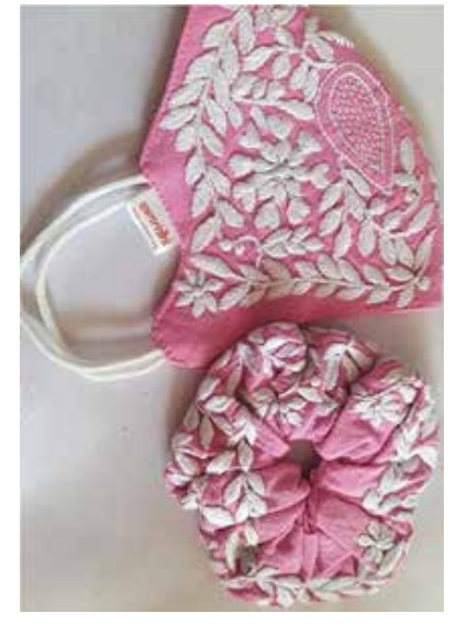
Through the Samridhi Saksham project, women artisans hand-crafted and embroidered masks and matching hair ties.

This project was recently featured as a case study in the research report, Reimagining the Craft Economy Post COVID-19 , in which the British Council made recommendations for creating a sustainable roadmap to recovery. The British Council was founded in 1934 and works in more than 100 countries encouraging cultural, scientific, technological, and educational cooperation with the United Kingdom.